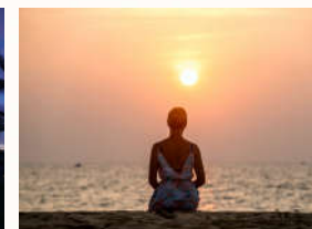
Enjoy the nature