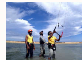
Safe kitesurfing classes

LKR 33.700 per person instead of LKR 65.300