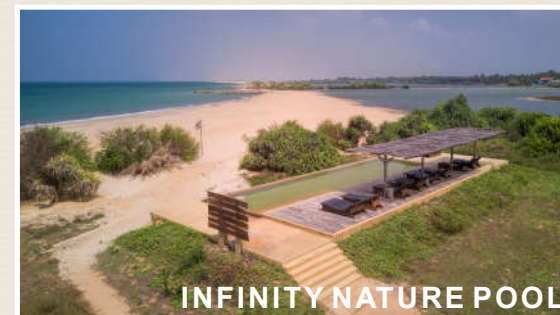
INFINITY NATURE POOL