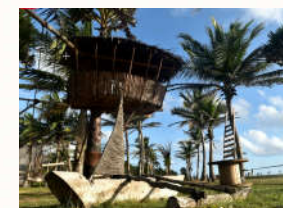
Adventure kids playground at Elements