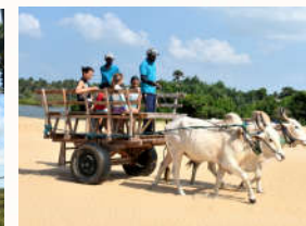
Traditional ox cart riding with the family