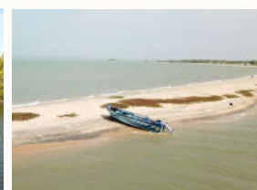
Safari to Puttalam lagoon