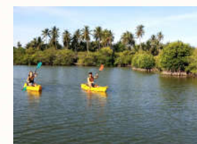
Kayaking in secluded lagoons