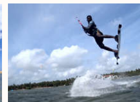
From zero to hero